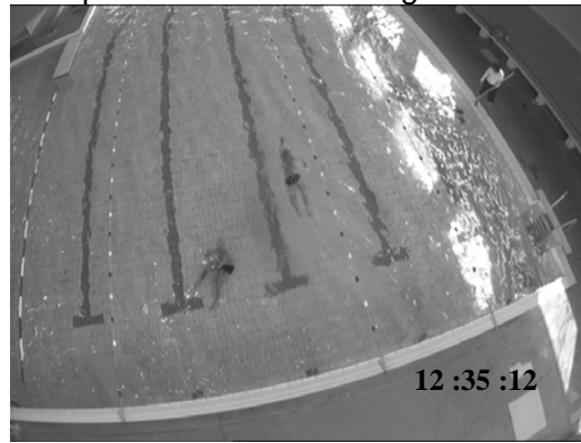
Image 2 : 12 :35 :12 swimmer immobilized on the pool bottom – drowning confirmed